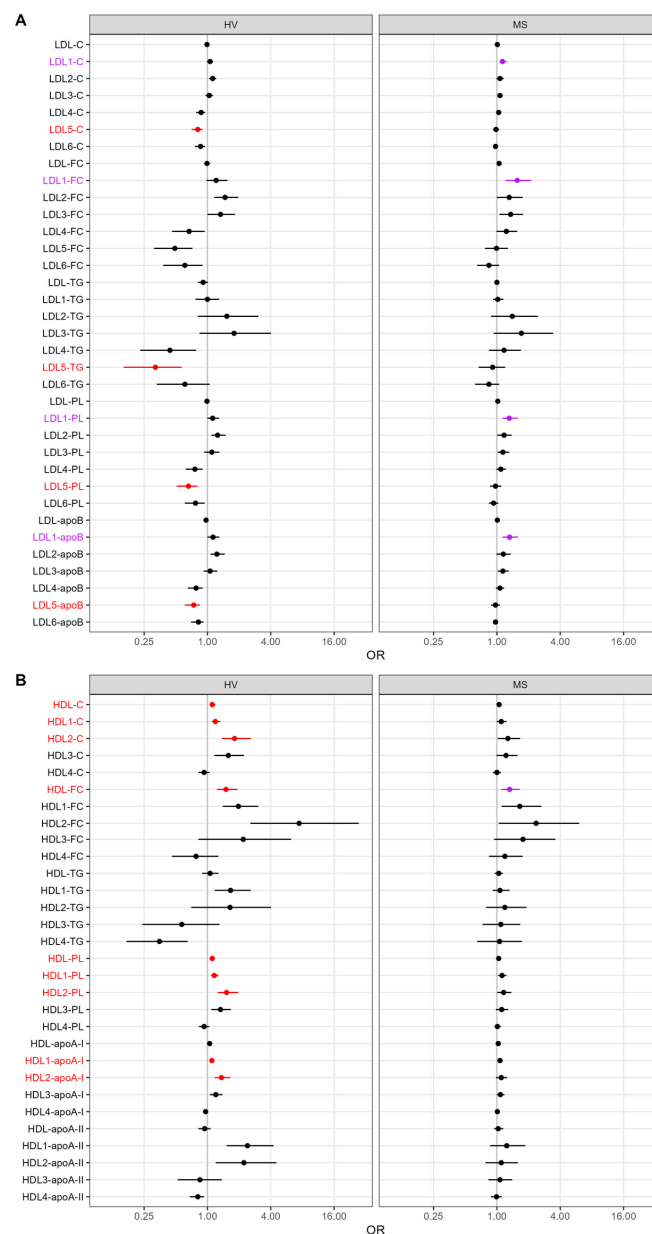
Figure 2. Logistic regression analyses to assess associations of lipoproteins and their subclasses with high vs. low adiponectin levels in the HVs and patients with MS. The results are presented as odds

To further examine the associations of the lipoprotein subclasses with high adiponectin levels, we performed univariable logistic regression analyses. In line with the results obtained with OPLS-DA, none of the VLDL and IDL parameters were significantly associated with high adiponectin levels (Figure S2). Again, in accordance with the OPLS-DA, in the HVs, there were significant associations of adiponectin with several indicators of small dense LDL subclass 5 (negatively), as well as with total and large buoyant HDL subclasses 1 and 2 (positively) (Figure 2A,B and Table S7). In patients with MS, there were no significant associations after Bonferroni correction for multiple testing. However, the lowest p-values were observed for the four indicators of the large buoyant LDL subclass 1 (Figure 2A and Table S7) as well as an indicator of total HDL (Figure 2B and Table S7). These parameters also showed the five highest VIP scores in the OPLS-DA (Figure 1D). All significant associations observed in the univariable logistic regression analysis were found to be insignificant upon adjusting for age, sex, and BMI (not shown).