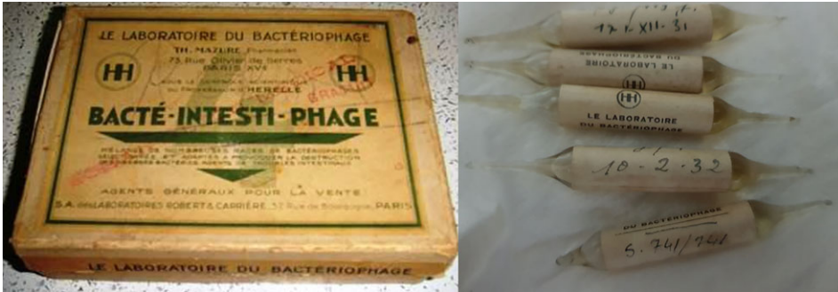
Figure 3. Phage preparations from d'Herelle's laboratory, indicating a widespread commercial presence. (Online version in colour.)