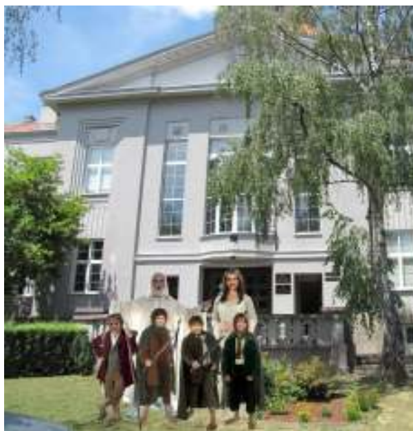
Department of Anatomy and Clinical Anatomy „Drago Perović” Institute of Anatomy