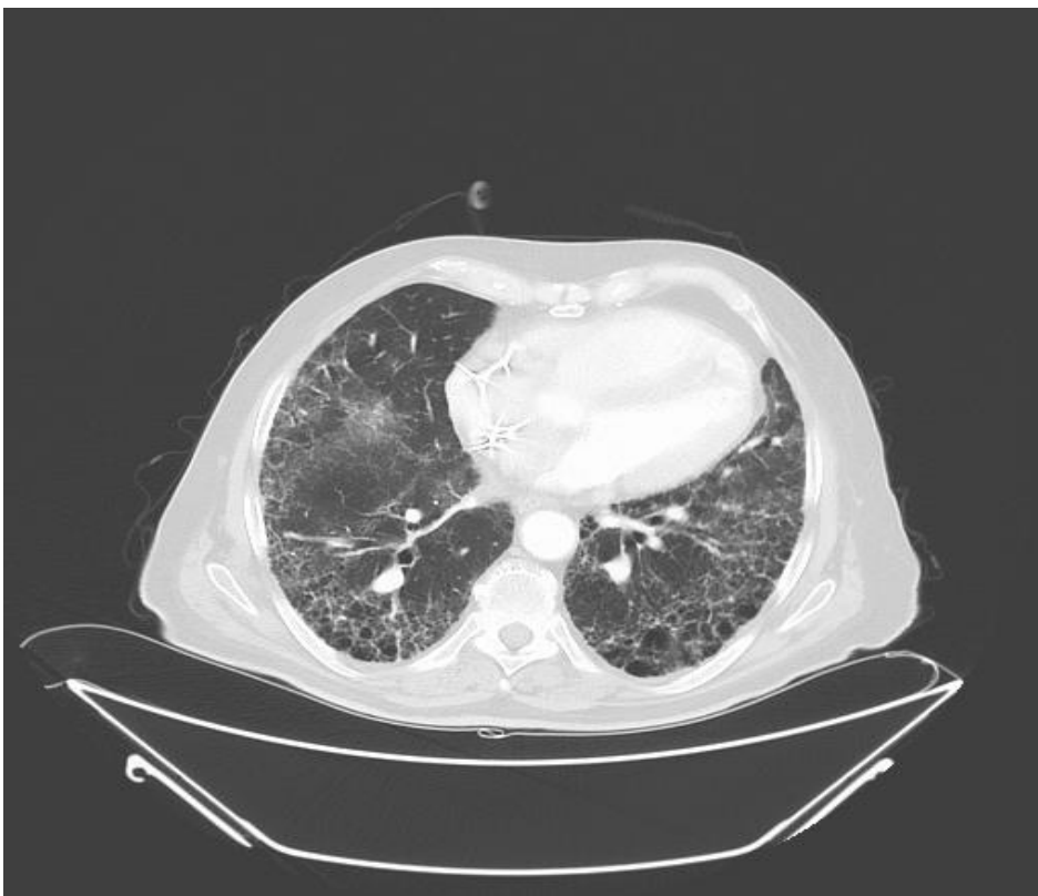
Image 2. Typical CT findings of ILF. Notice the bilateral cystic pattern in the basal areas, this is a typical of honeycombing in ILF.