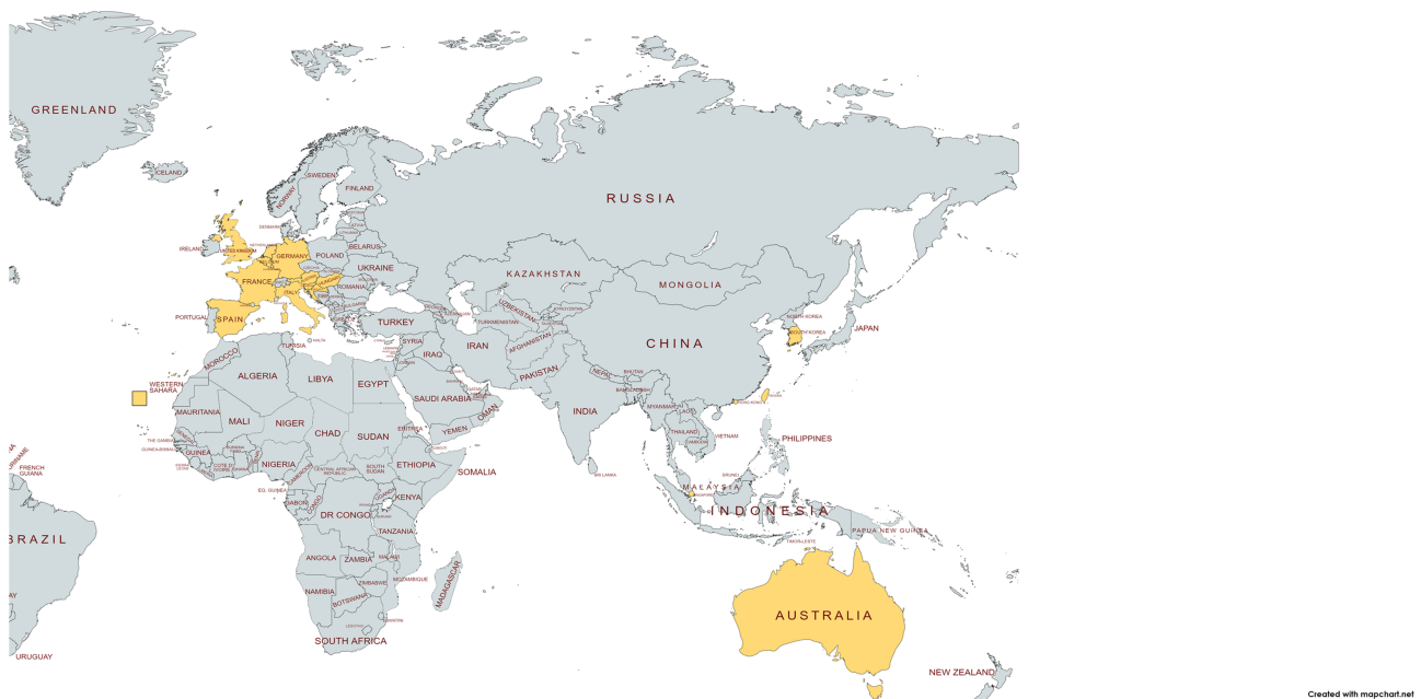
Figure 1 Countries currently participating in the ARTORIA-R.

The registry aims to achieve detailed information regarding the underlying congenital heart defect and the previous treatment of the patient. With this information, different cohorts [systemic left ventricle, systemic right ventricle, single ventricle (either anatomic left or right ventricle)] can be interrogated. Data will be collected about