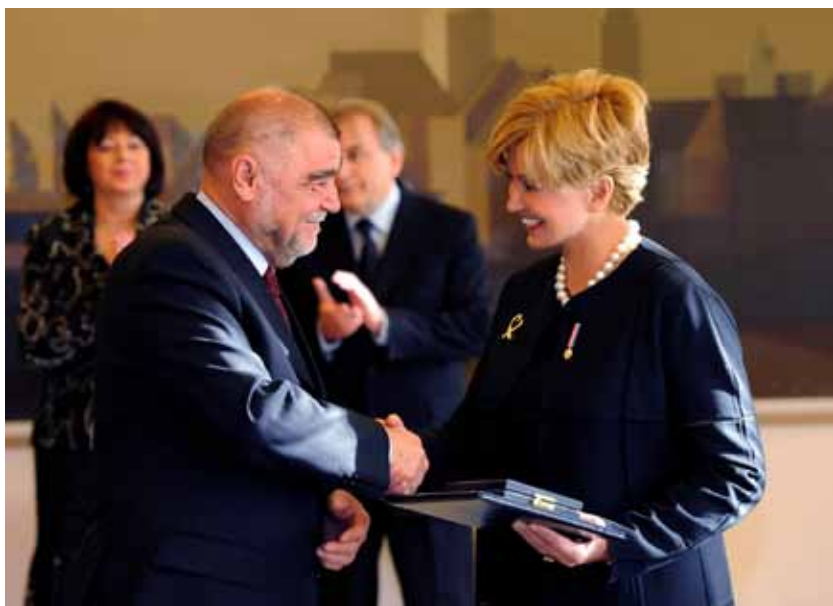
Figure 3. Stjepan Mesić, President of the Republic of Croatia, decorated Hedvig Hricak with the Order of the Croatian Star with the Effigy of Katarina Zrinska