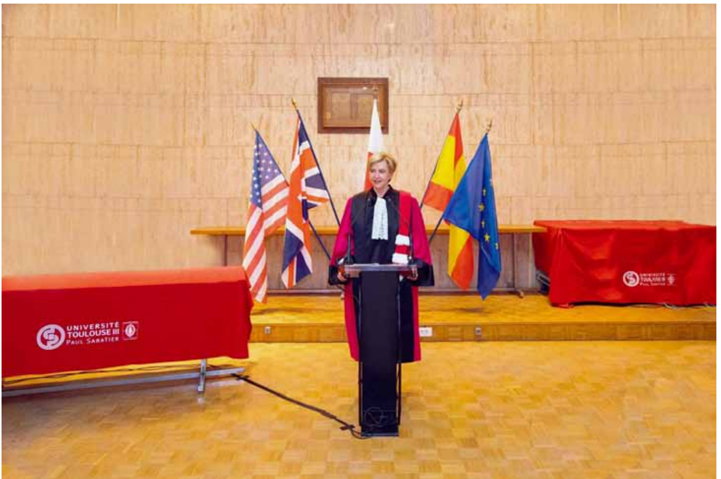
Figure 2. Honorary doctorates of the Ludwig Maximilian University, Munich (up) and the Toulouse III, Paul Sabatier University