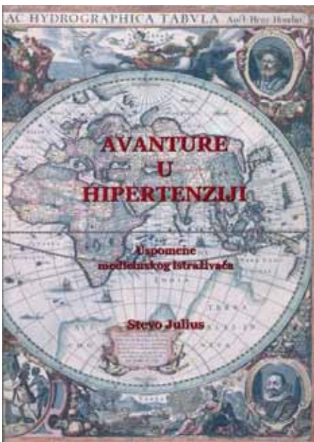
Figure 2. Stevo Julius: Avanture u hipertenziji: uspomene medicinskog istraživača / Adventures in Hypertension: Memoirs of a Life in Medical Science , Samobor, A. G. Matoš, 2011