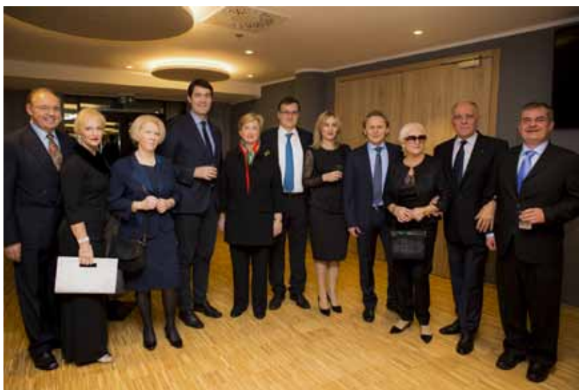
Figure 4. Ceremony marking the 100 th anniversary of the founding of the Faculty of Medicine of the University of Zagreb, 2017 – Hedvig Hricak receiving acknowledgement (up); Hedvig Hricak with invited guests at the festive dinner (down)