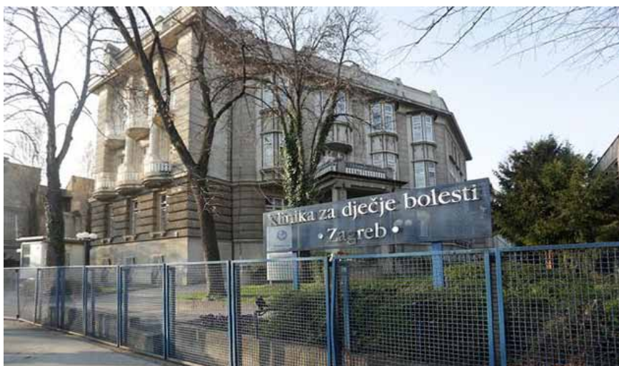
Figure 1a. Sick Children Hospital, Zagreb (architect Ignjat Fischer)