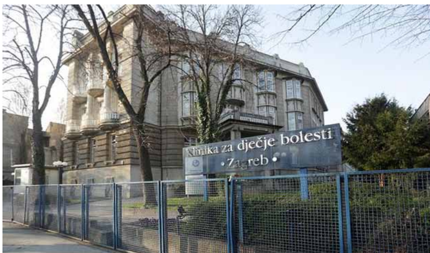
Figure 1a. Sick Children Hospital, Zagreb (architect Ignjat Fischer)