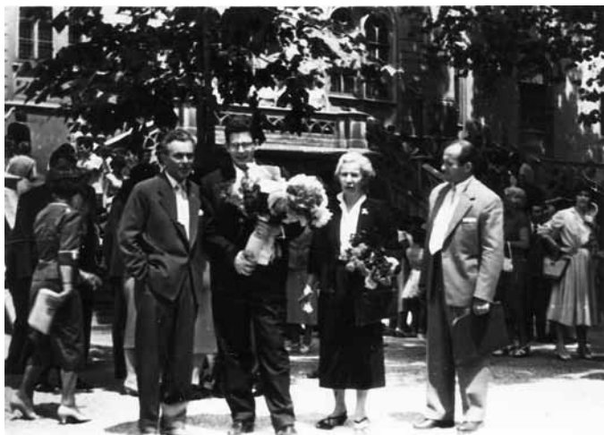
Figure 2. Norman Sartorius graduating from the University of Zagreb School of Medicine. Standing next to him are his mother and his uncles.