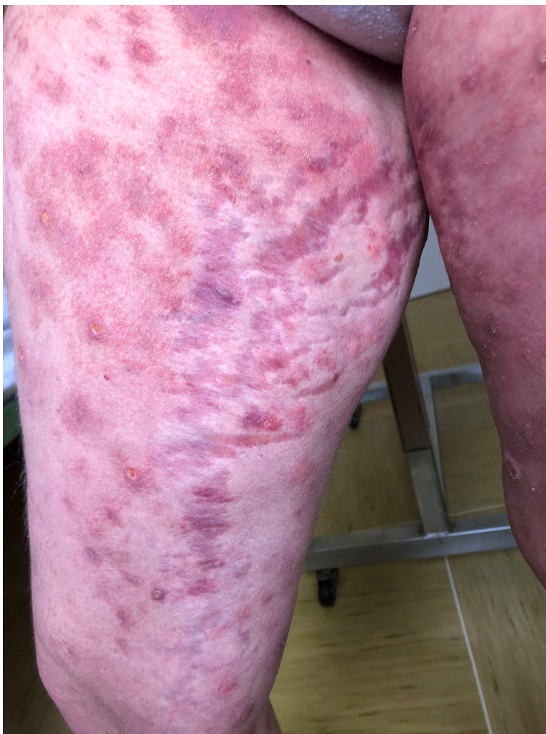
[Figure 1. Clinical findings of polymorphic eruption of pregnancy. Erythematous and urticarial papules and plaques within and surrounding the striae on the thigh.]

The disease is self-limiting and the lesions usually resolve within about 5 weeks after birth, with no pigment change or scarring (2). PEP is not associated with cutaneous manifestations or risk to the newborn or fetus (6).