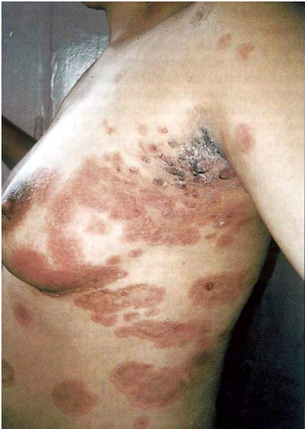
[Figure 2. Clinical findings of pemphigoid gestationis. Pruritic papules and plaques followed by clustered vesicles and tense bullae. Post inflammatory hyperpigmented lesions are also visible.]

risk of prematurity and small for gestational age neonates (25).