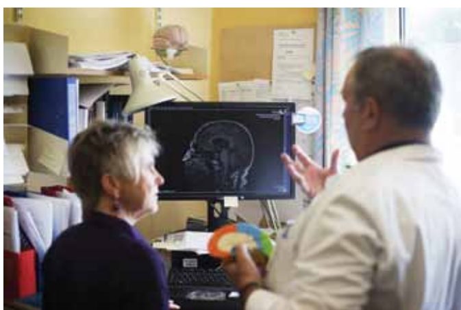
Figure 12. Explaining the brain to the patient, 2016 Oslo