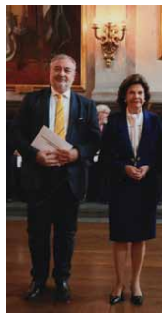
Figure 19. With Queen Silvia at the grant award ceremony 2023.

My advice is to master certain techniques and skills while you are still in Croatia. Also try to establish contacts with colleagues from other parts of the world by publishing in international journals, attending congresses, making poster presentations, using different EU programs for student exchange, define you research interest together with mentor, get a PhD or post-doc position in Croatia or abroad. If you go abroad try to come back to Croatia and build up scientific infrastructure and initiate the national and international projects helping country to enter international family of scientist and putting Croatia higher at the scientific map. That privilege to be accepted back in the country of origin is the most valuable step in forming the new scientific environment and usually it is highly appreciated. I deeply regret that I did not get an offer and chance to come back earlier and share my experience with experts in Croatia.