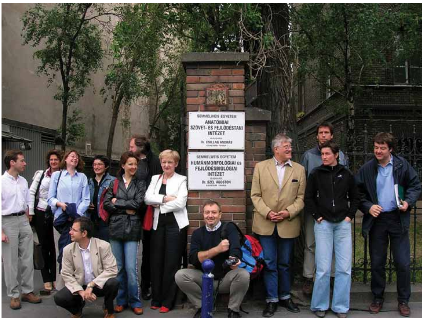
Figure 5. Brain Net Europe meeting in Budapest 2005

I found myself in very uncomfortable situation, but I said to myself to try to use the trick which did work on the end of the day. I had approached to Kostović and said that Knežević is very interested in the conference and that we have a unique opportunity for brainstorming between scientists in these two areas of neuroscience. The same arguments I presented to Knežević, and finally they both agreed and the conference took place in Dubrovnik 1990. I was so happy that I decided to do my best to have the conference succeed.