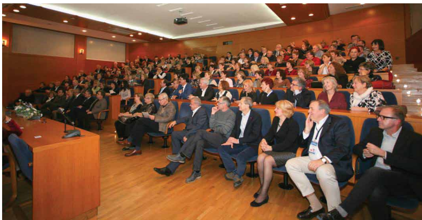
Figure 1. 40 years of generation, Zagreb, The Croatian Medical Association, 1976

Following the example of my parents I refused to be part of any group, political or religious or any other, or to yield to the pressure of such groups. Like my parents I have been trying to be progressive, to have empathy towards others irrespective of their background or origin. I was always impressed by those whose actions were based on knowledge and honesty, and had inherent personal values. That was and still is my modus vivendi .