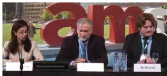
Figure 4. European Cancer Congress 2013 (ECCO-ESMO-ESTRO). Here in this picture at the news conference, I am discussing a study on the importance of molecular profiling in evaluation of cancers of unknown primary (CUP).