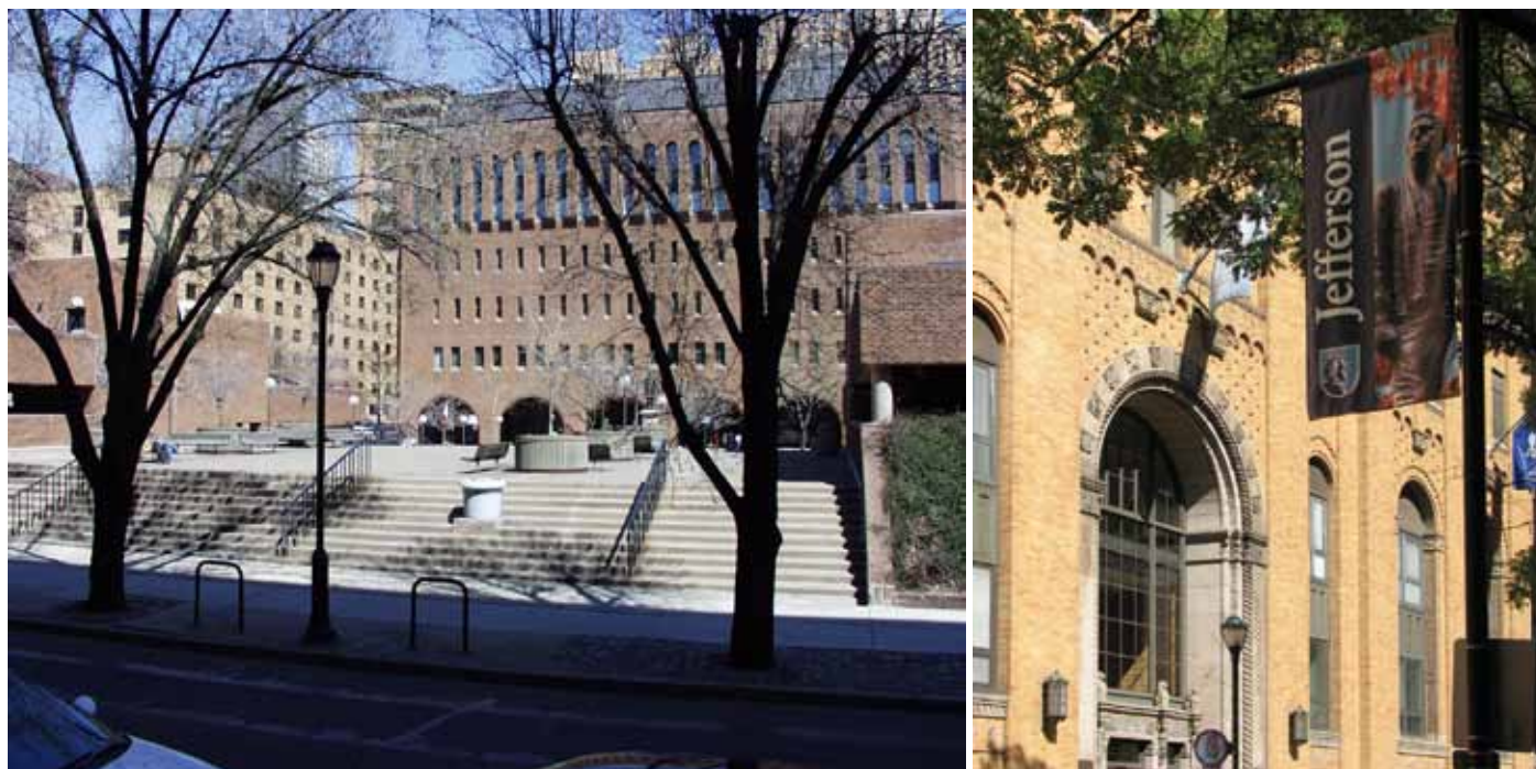
Figure 2ab. Thomas Jefferson University, Philadelphia. I started as a postdoc in 1990 and later completed my residency training in pathology in 1996.