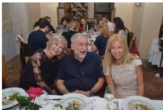
Figure 6. Several images from a couple of Ljudevit Jurak symposia (collage). It is always nice to meet old, and make new friends.