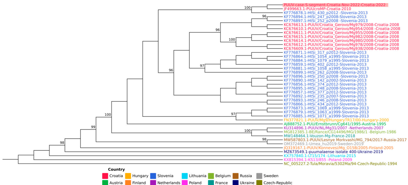
Figure 2. A subset of 40 PUUV S segments, emphasizing the geographic closeness of the origin countries is presented. Sequences are color-coded by the country of origin. A new sequence of the PUUV S segment from Croatia (marked with a red background) clusters with existing Croatian sequences. The value on the branches represents an ultrafast bootstrap approximation (only values above 95 are shown). The sequence of the Tula virus was used as a root (NC_005227.2).

The result of phylogenetic analysis is demonstrated in Figure 2. After trimming, we had 51,075,339 pair-end reads from SISPA A and 239,689,976 pair-end reads from SISPA B. Using de novo assembly, we generated a nearly complete S-segment of PUUV with a length of 1657 bp. We aligned the obtained PUUV S segment sequence with PUUV S sequences deposited to NCBI from Croatia and neighboring European countries using MAFFT (v. 7.505) [27].