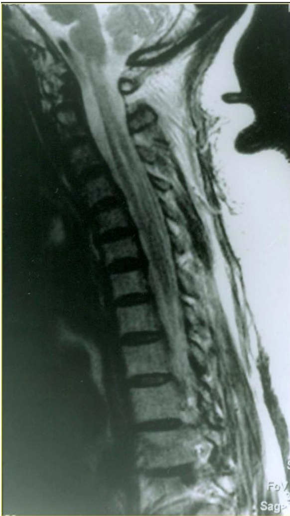
Figure 1 A

Figure 1 Magnetic resonance imaging findings: (A) T2 weighted image of the cervical spine showing cavitation extending over the first six vertebrae; (B) T2 weighted transverse image of the cervical spine showing an area of high signal intensity in the lateral and dorsal columns.