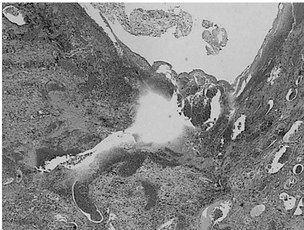
Fig. 1. Necrosis of the intestinal wall with some hemorrhage and inflammation. Hematoxylin-eosin, x200.

AdoMet: S-adenosylmethionine, AdoHcy: S-adenosyl-L-homocysteine