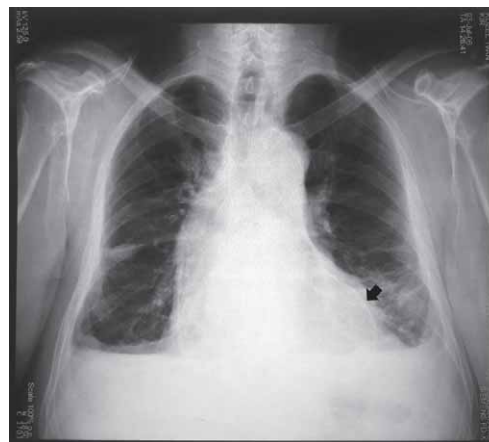
Fig. 1. Chest X-ray (AP) showing contrast extralumination into pericardium (black arrow).

Emergency reoperation was indicated. An attempt was made to suture the stomach ulcer through the right thoracotomy. It had to be abandoned however, after several attempts, due to the wall fragmentation and rigidity. The gastric tube was removed, the duodenum was blindly closed, esophageal cervicostoma was performed and permanent jejunostoma created. The colon was prepared for the scheduled coloplasty, after which the patient stayed at ICU for three weeks. Pleural cavity was rinsed with diluted Betadine solution several times a day. The patient was administered antibiotic therapy and antifungal therapy. Thoracic drain from the right chest was removed on postoperative day 10. After initial improvement and mobilization with normal nutrition via je-