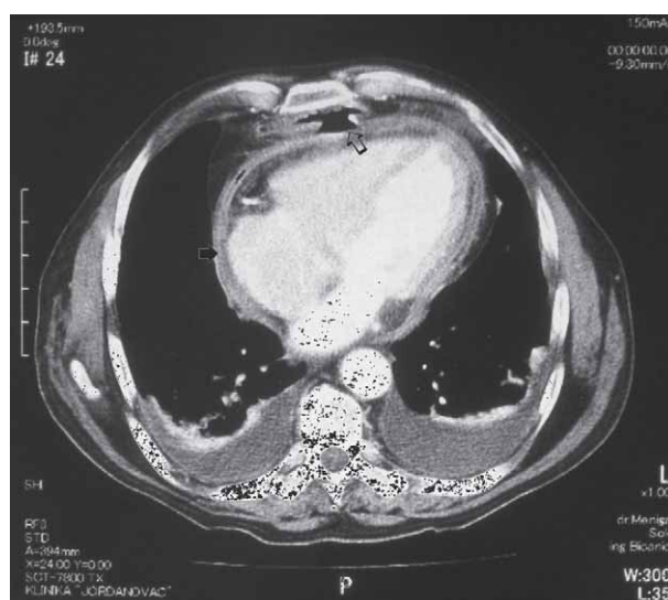
Fig. 3. MSCT scan of the thorax showing contrast in the pericardium (white arrow) and gastric tube (blank arrow). Note: bilateral pleural effusions.