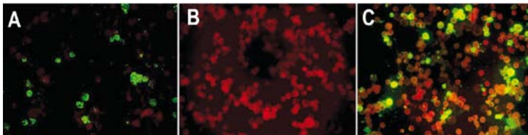
Figure 1. Detection of human metapneumovirus in an indirect immunofluorescent assay. A) positive control (hMPV-infected cells recognized by monoclonal antibodies against N protein of hMPV, KE11-3); B) negative control (mock-infected cells); C) reaction with a positive serum sample.

HMPV-infected cells were confirmed by IFA, using mouse monoclonal antibodies against nucleocapsid (N) and fusion (F) protein of hMPV, which reacts both against A and B hMPV genotypes prepared at Rochester General Hospital, University of Rochester School of Medicine and Dentistry, Rochester, NY, USA (Figure 1A). Mock-infected cells were used as negative control (Figure 1B).