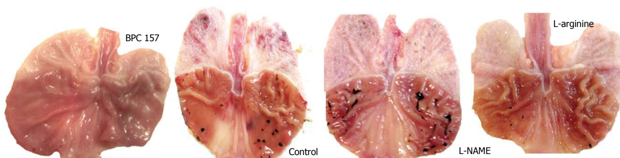
Figure 1 Gross presentation of celecoxib-induced gastric lesions at 48 h.

half of the mucosal thickness to full-blown ulcers; the defect bed was debris-covered, partially by erythrocytes, and it was surrounded by an edematous lamina propria with polymorphonuclear infiltration) showed a gradual increase from 24 h to 48 h after administration, while the liver and brain lesions showed sustained levels (Table 1, Figure 1).