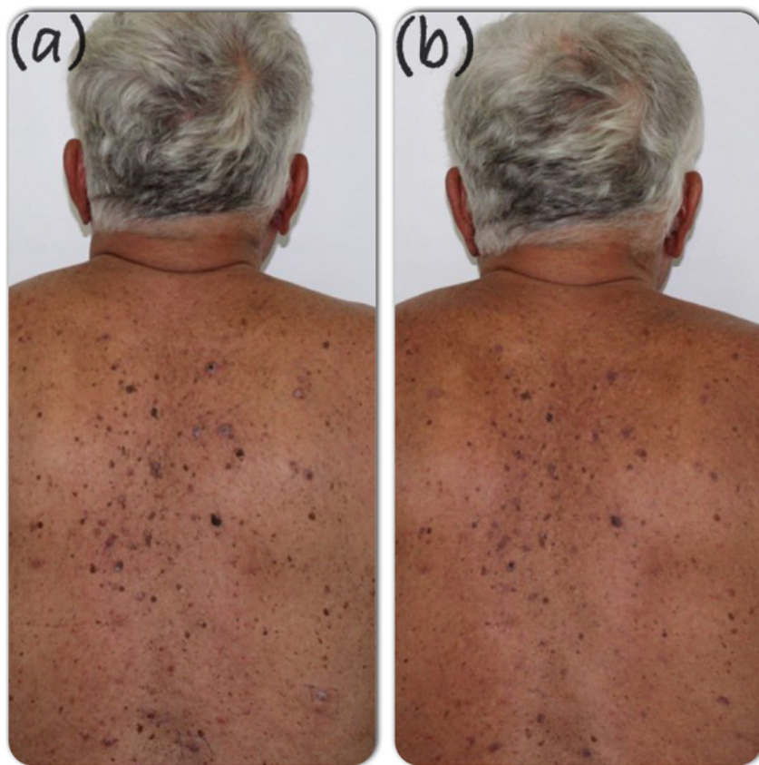
Figure 1. Clinical findings. (A) A large number of well-demarcated, dome-shaped nodules with a rolled, mildly erythematous border and central hyperkeratotic plug on the back (before the treatment). (B) The total count of lesions was reduced and signs of regression were present, resulting in loss of palpability.

After surgery, acitretin 50 mg/day was administered, subsequently reduced to 30 mg/day after a month due to nonspecific bone/muscle pain.