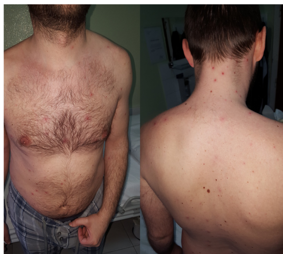
Fig. 1 Papular and vesicular rash on the neck and trunk

conditions and an increased occurrence of some other serious bacterial, fungal and certain viral infections [4–6].