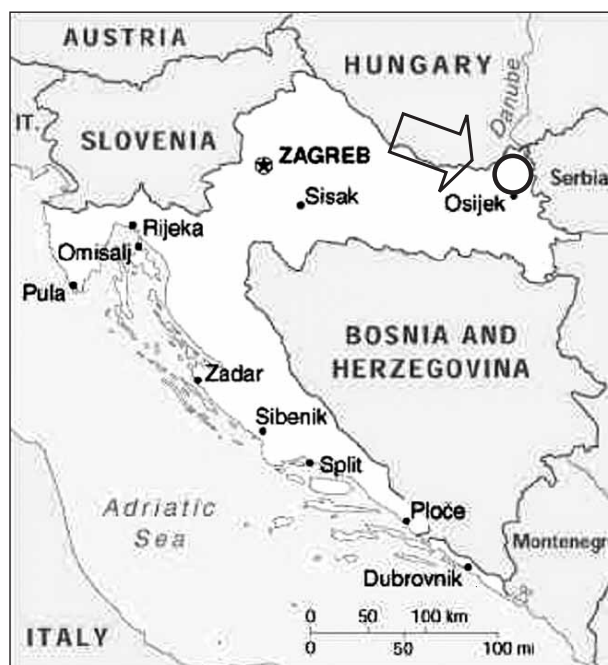
Fig. 1. Croatia: Baranja region.

The oldest traces of human presence date from the Neolithic period. The Hungarians arrived at the end of the 9th century and mostly assimilated the already settled Slavs. Serbs came to Baranja during the Ottoman period (1526–1687). When the Turks had retreated after liberation, the deserted Baranja was settled by Croats (Šokci) from the surroundings of Srebrenica in Bosnia (1689–1713), and during the Crnojević migration (Čarnojevići) a lot of Serbs came along. From 1720 onwards immigrated the Germans, mostly from Austria, the Rhine basin and Bavaria. According to the historical data, Baranja had 6,900 inhabitants in 1720. Since then, except