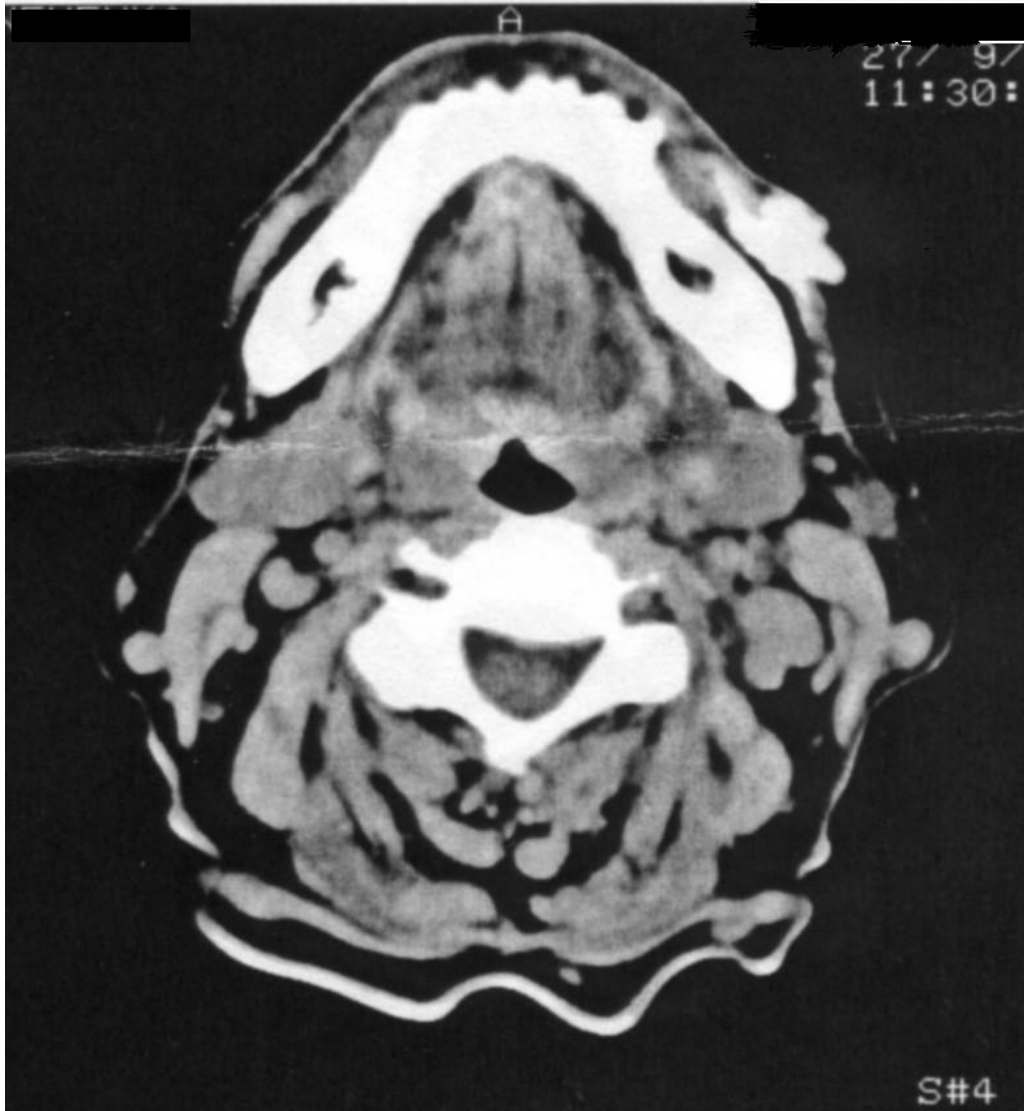
Figure 1. Axial CT scan – High density areas in the vicinity of the mandibular lower border were not recognized.