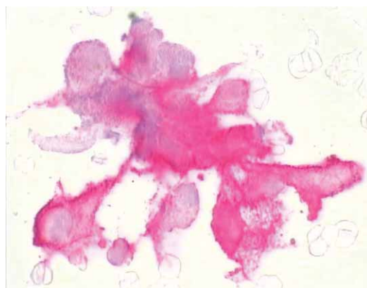
Fig. 3. Hepatic epitheloid hemangioendothelioma cells – positive immunostaining to CD34 (LSAB).