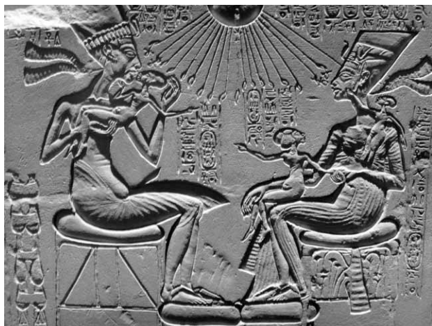
Fig. 1. Akhenaten with his wife and daughters.

Our hypothesis is that Akhenaten was suffering of homocystinuria. In next section we will first make a critical review of up-to-date theories and then we will explain advantages and disadvantages of our theory.