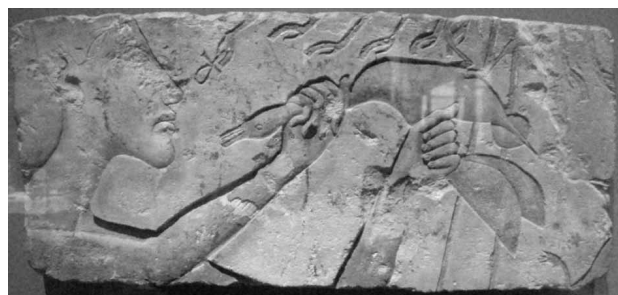
Fig. 2. Akhenaten is sacrificing a duck.