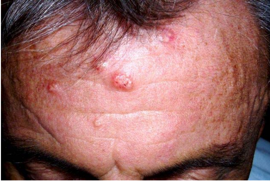
Fig. 3. Solitary and confluent mollusca contagiosa on the forehead (extragenital localisation!) in HIV/AIDS patient.