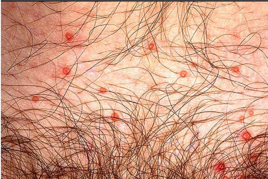
Fig. 2. Mollusca contagiosa as STI in adults typically involving lower abdomen and pubic region.