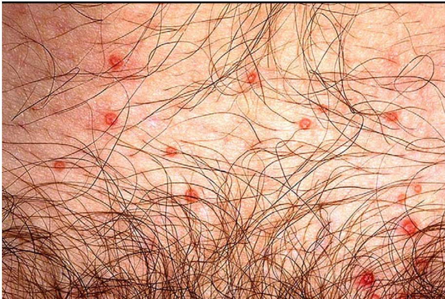
Fig. 2. Mollusca contagiosa as STI in adults typically involving lower abdomen and pubic region.