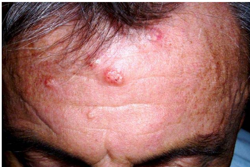
Fig. 3. Solitary and confluent mollusca contagiosa on the forehead (extragenital localisation!) in HIV/AIDS patient.