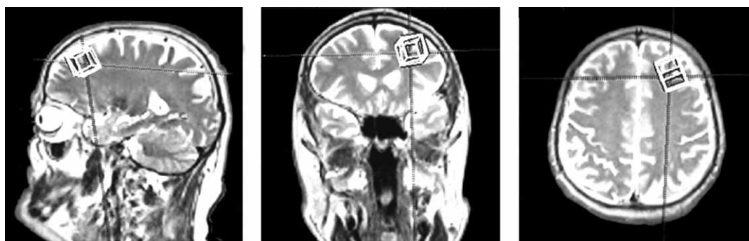
Fig. 1. Spectroscopic Volume of Interest (VOI) in the dorsolateral prefrontal cortex.

Following the above mentioned procedures, diagnostic MRI scans were done on a 3T MRI unit, to exclude potential cerebrovascular disease underlying the diagnosed clinical condition. Providing all of the above tests suggested diagnosis of AD and neuroradiological finding provided no proof of underlying cerebrovascular disease, subjects were diagnosed with AD. All subjects gave their voluntary informed consent, either themselves, or through their caregiver, in case when their condition rendered them incapable of understanding the subject information sheet. Altogether 12 subjects (7 female and 5 male) were