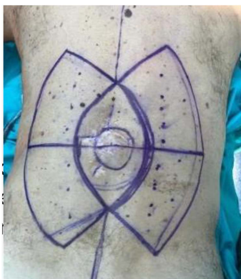
Figure 2. Preoperative markings.