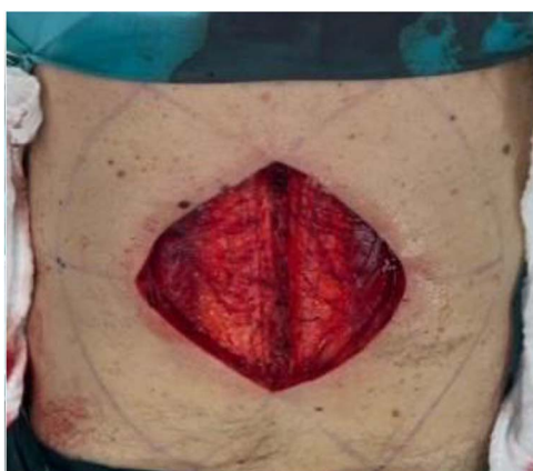
Figure 3. Intraoperative extent of the defect.