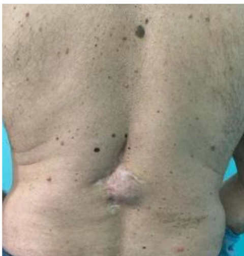
Figure 1. Preoperative local finding.