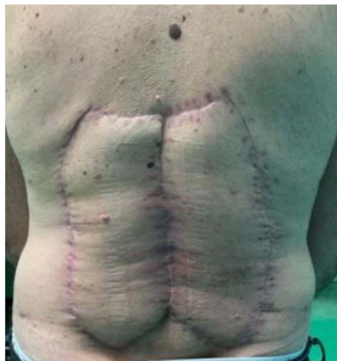
Figure 4. Local findings 1 month after surgery.

The Keystone Island flap was first described in 2003 [3]. It is a perforator-based island flap that is applicable on all body parts and used as a reliable technique of soft tissue defect closure, avoiding more complex flap designs [4, 5]. It shows better results