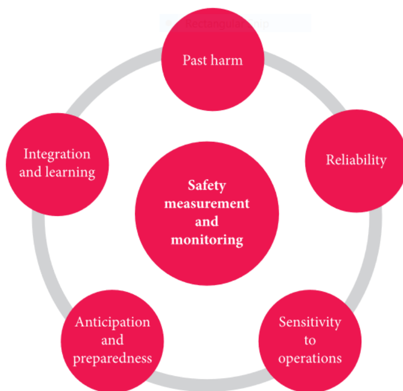
Figure 5-3: A framework for safety measurement and monitoring

In The measurement and monitoring of safety , the authors have developed a framework which they believe should be included in any safety and monitoring approach to give a comprehensive and rounded picture of a healthcare organisation's safety (Vincent et al., 2013). The framework encompasses the principal facets of safety while providing clarity and simplicity at the same time (Figure 5-3).