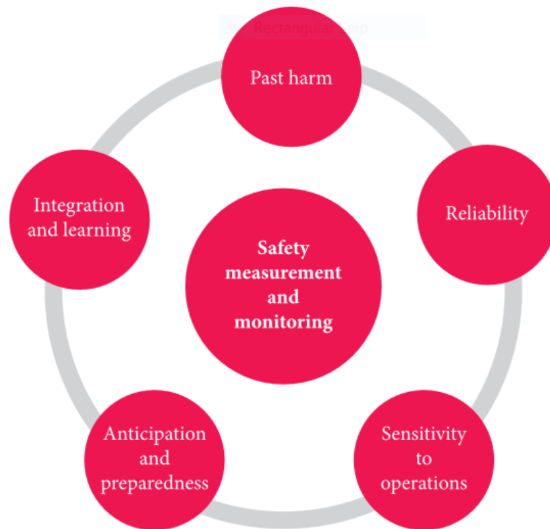
Figure 5-3: A framework for safety measurement and monitoring

In The measurement and monitoring of safety , the authors have developed a framework which they believe should be included in any safety and monitoring approach to give a comprehensive and rounded picture of a healthcare organisation's safety (Vincent et al., 2013). The framework encompasses the principal facets of safety while providing clarity and simplicity at the same time (Figure 5-3).