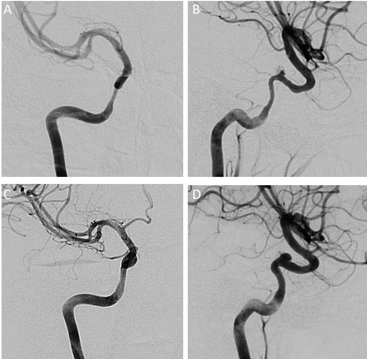
Figure 2. Anteroposterior and lateral projection of right internal carotid artery angiogram prior to initiation of corticosteroid therapy demonstrating narrowing of the petrous and proximal cavernous segments (A,B). Right internal carotid artery angiograms after 10 months of corticosteroid therapy, showing improvement in the stenosis with minimal residual narrowing of the petrous segment(C,D).

Ethical approval: This article does not contain research including human participants or animals performed by any of the authors.