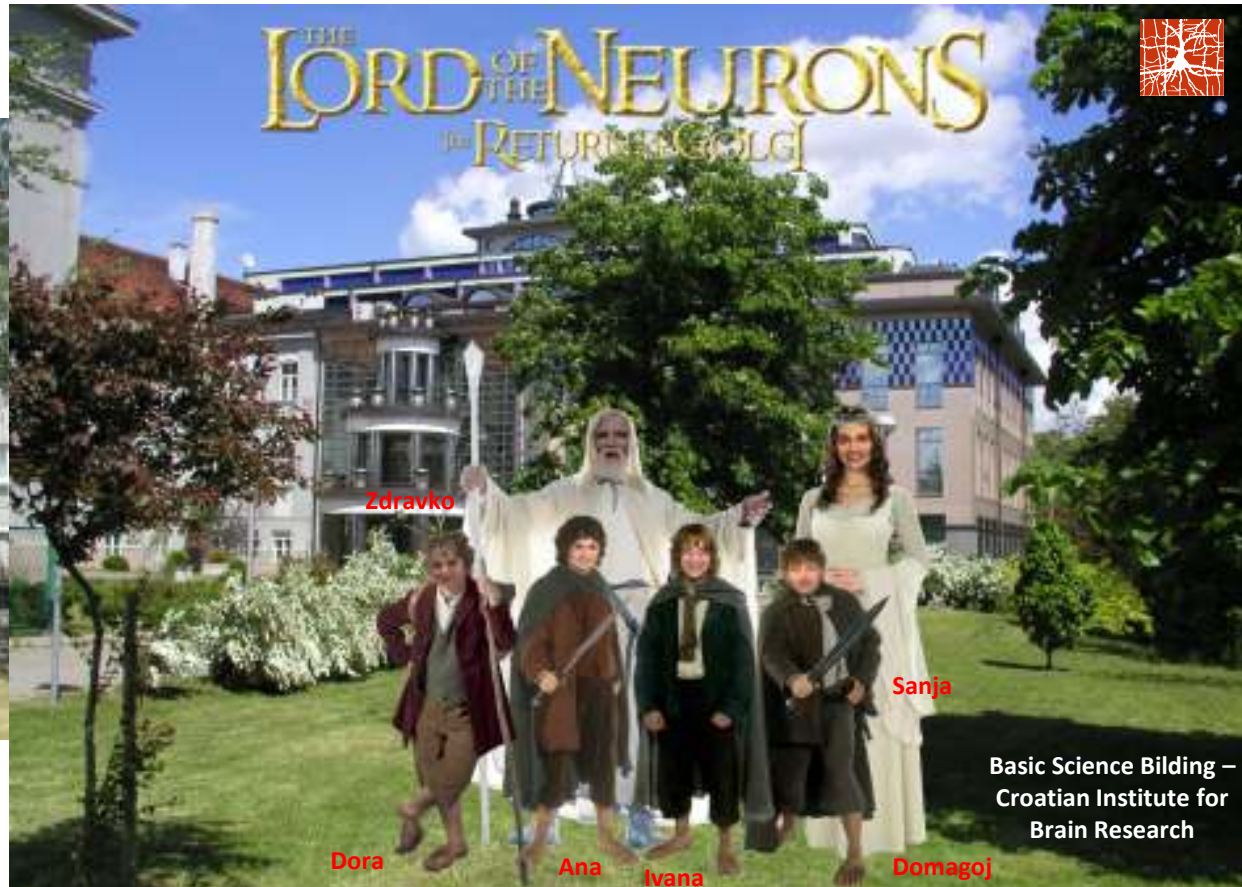
Basic Science Bilding – Croatian Institute for Brain Research