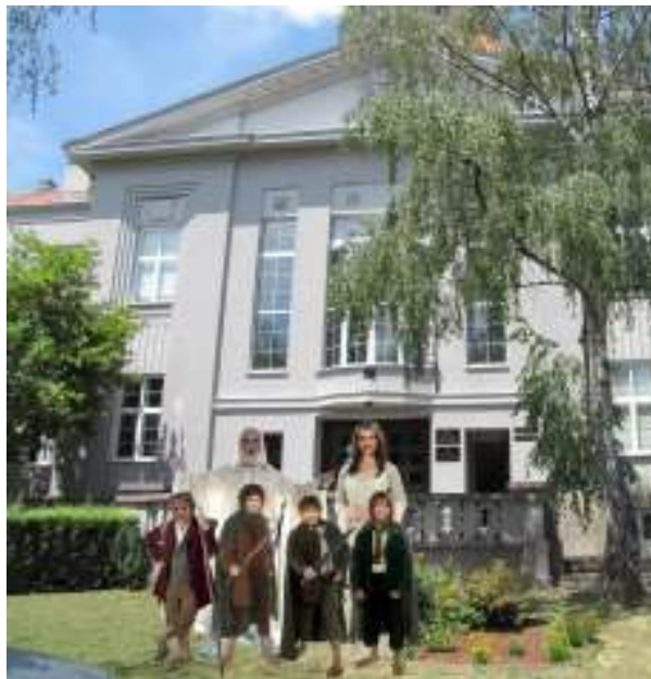
Department of Anatomy and Clinical Anatomy „Drago Perović” Institute of Anatomy