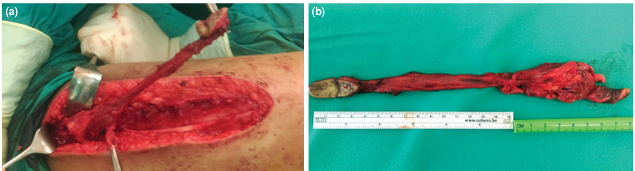
FIGURE 2. Intraoperative photographs. (a) Right thigh from lateral side - a long subfascial cutaneous fistula going from the middle third of the thigh to the greater trochanter region is visible; (b) Completely excised fistula and affected bursa before sending to pathology.

intraoperative finding of a cutaneous fistula, the skin incision was extended to track the fistula proximally. The fistula was marked with a probe, and a detailed exposure showed a subfascial fistula connected to the enlarged trochanteric bursa (Figure 2a). While operating on the trochanteric bursa, it partially ruptured and whitish liquid tissue, resembling pus was observed. At this point, TB was suspected and the material was taken for acid fast laboratory diagnostics. The fistula and trochanteric bursa were excised completely and sent to pathology (Figure 2b).