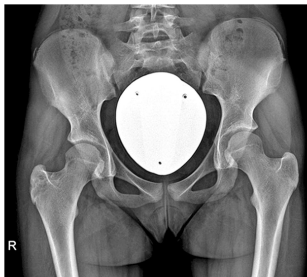
FIGURE 1. Hip anteroposterior radiograph of a 14-year-old patient. In the right hip region, a lesion of the greater trochanter with surrounding reactive sclerosis of the lateral aspect, and without periosteal reaction is visible. Soft tissue edema is present around the right greater trochanter.

Surgery started with scar tissue excision around the previous wound. However, due to the