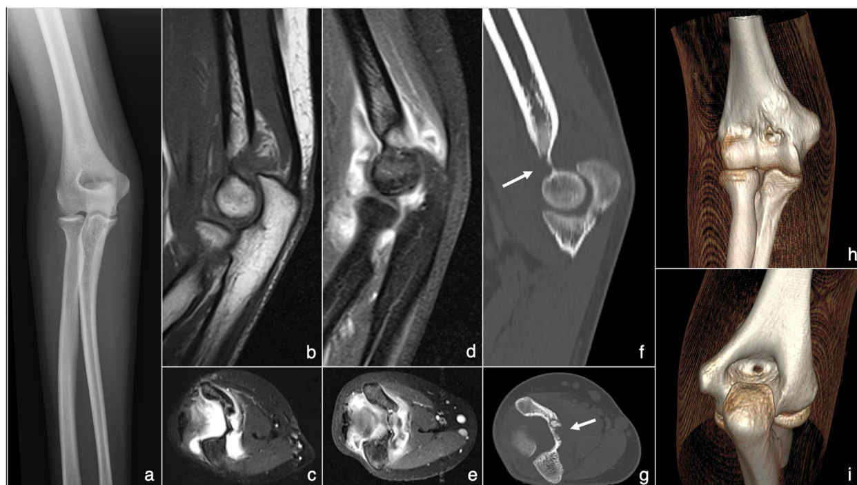
Fig. 3 Various radiographic modalities performed on a patient with elbow osteoid osteoma presented in this study: a plain radiography anteroposterior projection image of the right elbow affected by osteoid osteoma; b sagittal MRI projection image of the right elbow showing mild signs of elbow oedema; c axial MRI projection image of the right elbow showing signs of elbow oedema; d sagittal magnetic resonance arthrography projection image of the right elbow showing signs of elbow edema; e axial magnetic resonance arthrography projection image of the right elbow showing signs of elbow edema; f sagittal CT projection image of the right elbow with an arrow pointing to the osteoid osteoma site in between coronoid and olecranon fossa; g axial CT projection image of the right elbow with an arrow pointing to the osteoid osteoma site in between coronoid and olecranon fossa; h 3D reconstruction CT image of the right elbow demonstrating osteoid osteoma site from the anterior view; i 3D reconstruction CT image of the right elbow showing osteoid osteoma site from the posterior view

occur as pain within the first seven months after the procedure [16, 46, 58].