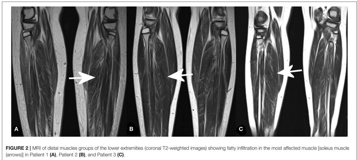
FIGURE 2 | MRI of distal muscles groups of the lower extremities (coronal T2-weighted images) showing fatty infiltration in the most affected muscle [soleus muscle (arrows)] in Patient 1 (A), Patient 2 (B), and Patient 3 (C).