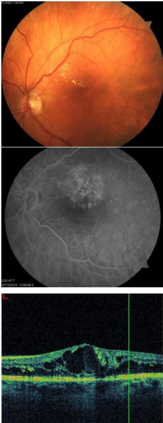
FIGURE 5 : FUNDUS PHOTOGRAPHY, FLUORESCIN ANGIOGRAPHY AND OPTICAL COHERENCE TOMOGRAPHY OF DIABETIC MACULAR EDEMA