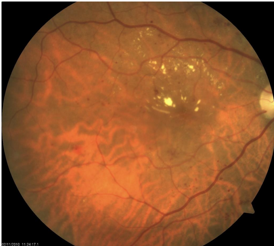
FIGURE 2 : FUNDUS PHOTOGRAPHY OF DIABETIC MACULAR EDEMA AND NONPROLIFERATIVE DIABETIC RETINOPATHY

DME can occur at any stage of DR (14). It involves thickening of the macula due to leakage of fluid from retinal capillaries (22). Sight loss from macular edema is typical of DM type 2 while intraocular haemorrhage and tractional retinal detachment are more common in DM type 1. DME is the most common cause of visual disability in DR (16). Even though DME can occur at any stage, it is more commonly associated with later stages of diabetic retinopathy. It is traditionally classified as either focal edema, with leakage associated with discrete areas of microaneurysms and hard exudates, and diffuse edema (21).