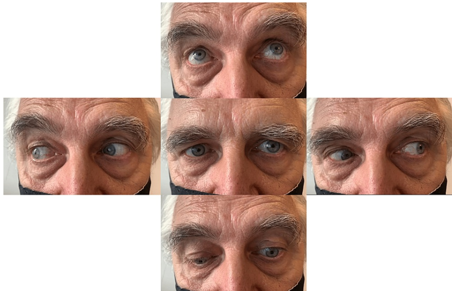
FIGURE 2: Bulbomotor examination two months after treatment initiation showed significant improvement, left eye remained paretic only when looking down.