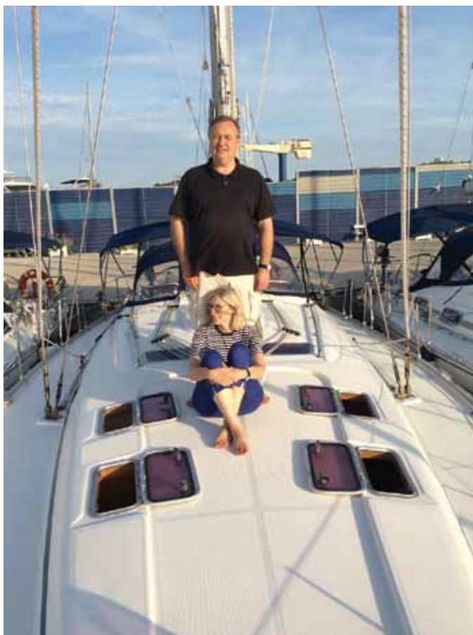
Figure 15. With my wife at the summer holidays 2015