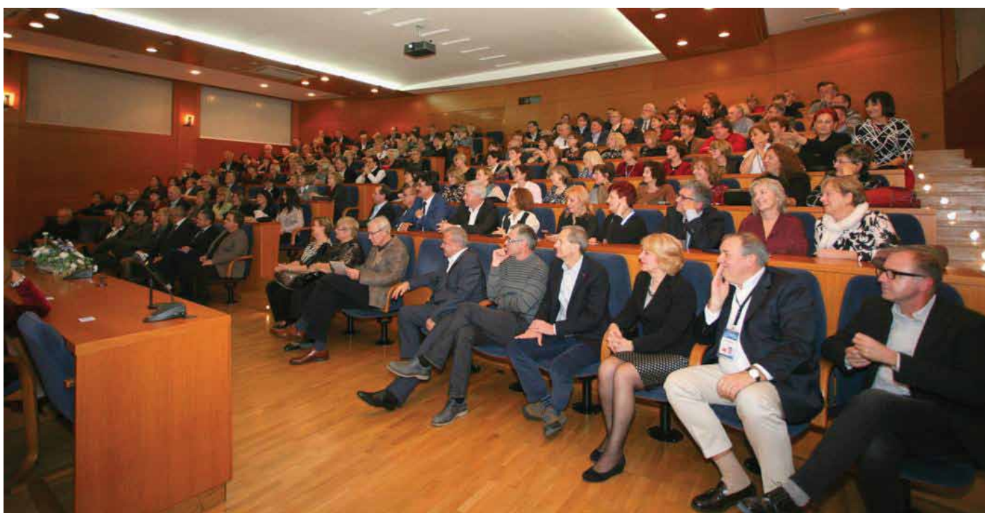
Figure 1. 40 years of generation, Zagreb, The Croatian Medical Association, 1976

Following the example of my parents I refused to be part of any group, political or religious or any other, or to yield to the pressure of such groups. Like my parents I have been trying to be progressive, to have empathy towards others irrespective of their background or origin. I was always impressed by those whose actions were based on knowledge and honesty, and had inherent personal values. That was and still is my modus vivendi .