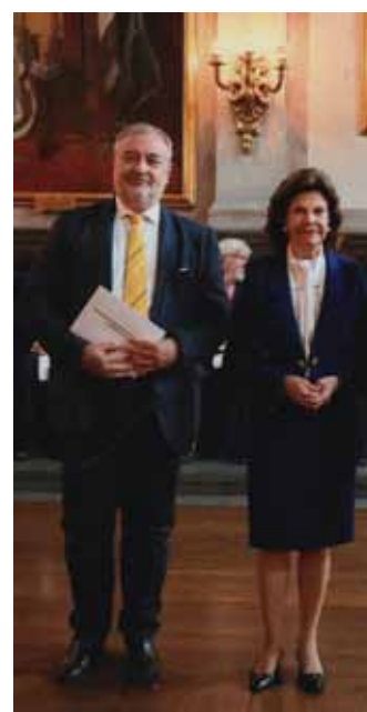
Figure 19. With Queen Silvia at the grant award ceremony 2023.

My advice is to master certain techniques and skills while you are still in Croatia. Also try to establish contacts with colleagues from other parts of the world by publishing in international journals, attending congresses, making poster presentations, using different EU programs for student exchange, define you research interest together with mentor, get a PhD or post-doc position in Croatia or abroad. If you go abroad try to come back to Croatia and build up scientific infrastructure and initiate the national and international projects helping country to enter international family of scientist and putting Croatia higher at the scientific map. That privilege to be accepted back in the country of origin is the most valuable step in forming the new scientific environment and usually it is highly appreciated. I deeply regret that I did not get an offer and chance to come back earlier and share my experience with experts in Croatia.