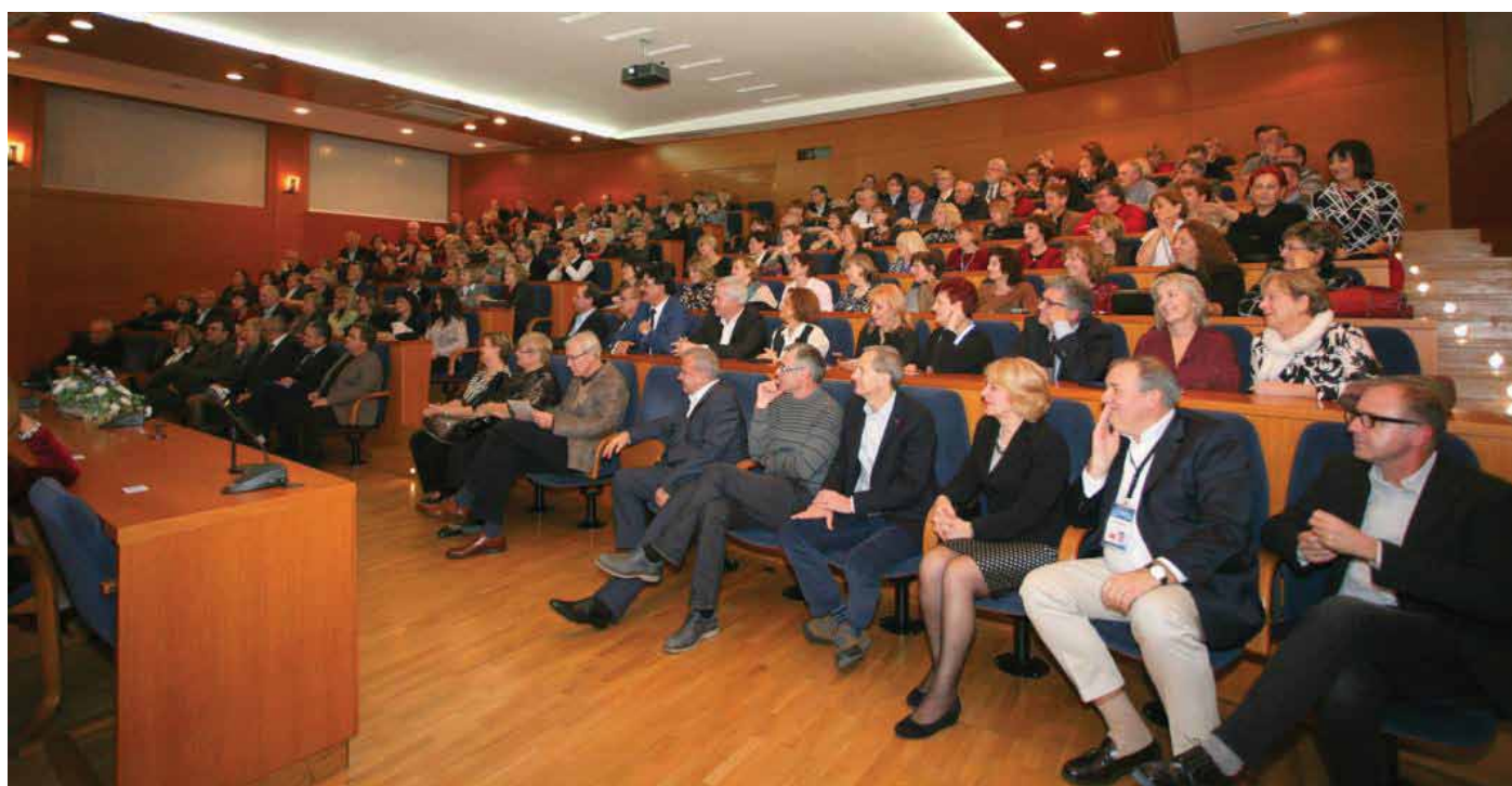
Figure 1. 40 years of generation, Zagreb, The Croatian Medical Association, 1976

Following the example of my parents I refused to be part of any group, political or religious or any other, or to yield to the pressure of such groups. Like my parents I have been trying to be progressive, to have empathy towards others irrespective of their background or origin. I was always impressed by those whose actions were based on knowledge and honesty, and had inherent personal values. That was and still is my modus vivendi .