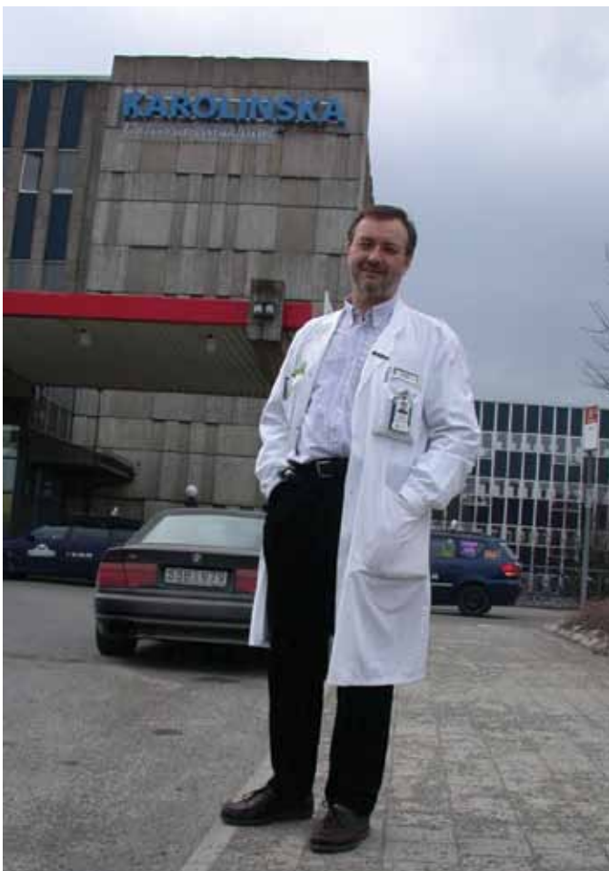
Figure 9. In front of Karolinska Hospital 2006

fixation and tissue preparation is crucial for immunostaining. I decided to do everything by myself hoping that I will get a result. It was a very stressful moment but I was highly motivated to succeed. At the end I managed to complete the immunostaining. I was so overwhelmed with emotions that I started to cry in my small room, but then I pulled myself together, and then came out and showed the results to the rest of my group. I knew that I am going to change my position in the group and from a visitor become a respectful and fully accepted member. After that I did have much more freedom especially after the missteps in the immunostaining protocol had been changed. That technician responsible for the immunostaining was later included in my own group and today we are best professional colleagues. For me this event showed how important it is bring knowledge and useful working skills from your native country, especially if you have skills that the host may not have.