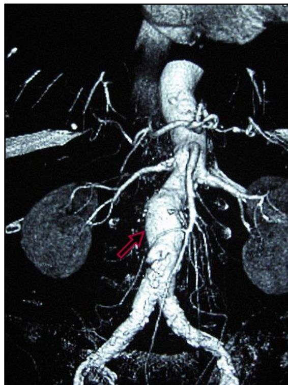
Figure 2. AAA, shown on the Multi-Slice Computed Tomography (MSCT), surface rendering (the patent lumen is filled with contrast, while the real aneurysm size can be deduced by noticing the wall calcifications producing an egg-shell semilunar appearance, to the left of the visible lumen).

An abdominal aortic aneurysm (AAA) is defined as a localized dilation of an abdominal aorta with a diameter of 3 cm or more. AAAs can be further classified into infrarenal, juxtarenal, pararenal, and suprarenal aortic aneurysms, depending on the relationship to renal arteries. The aneurysms extending upwards to the level of the diaphragm are, however, classified as Crawford Type IV thoracoabdominal aortic aneurysms (TAAA), due to a similar surgical approach and management as for the other types of TAAA's (25,29).