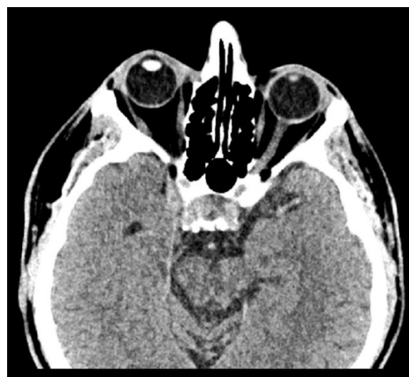
Figure 1b CT image of the patient in axial plane. There were no signs of inflammation of the sphenoid and ethmoid sinus. Slika 1b. CT slika bolesnika u aksijalnoj ravnini. Nije bilo znakova upale sfenoidnog i etmoidnog sinusa.