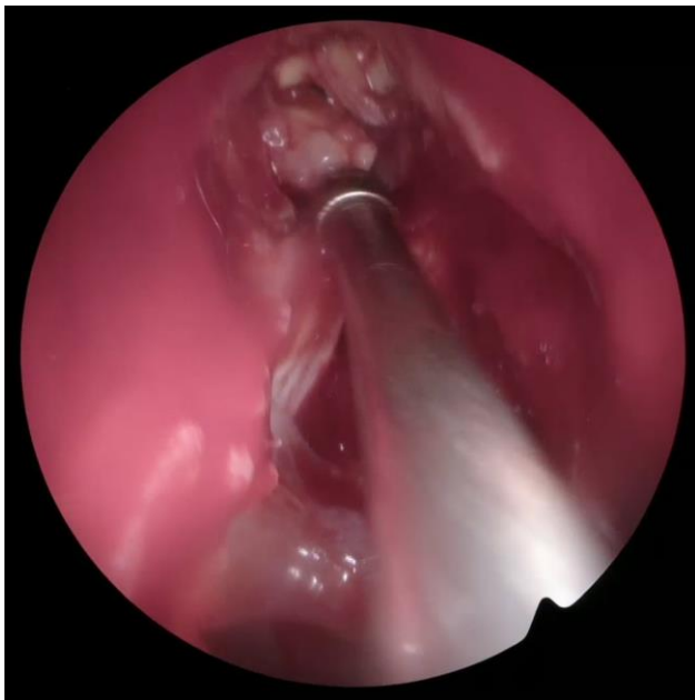
Figure 2 Intraoperative photo of the functional endoscopic frontal sinus surgery. A tumor mass is filling the entire right frontal sinus.

Slika 2. Intraoperativna fotografija funkcionalne endoskopske operacije frontalnog sinusa. Tumorska masa ispunjava cijeli desni frontalni sinus.