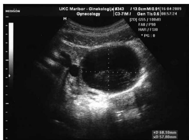
Fig. 1. Ultrasound imaging of pelvis showing hypoechogenic cystic formation 64×56 mm in the right ovary with irregular echogenitiy inside and highly vascularized cysts wall.