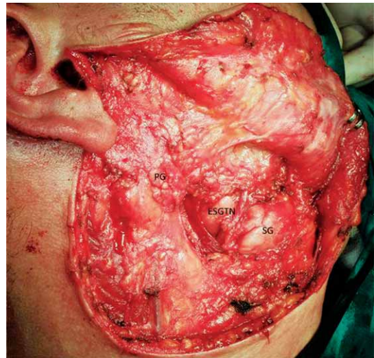
Fig. 3. Intraoperative view showing the retracted subplatysmal flap with the tumour seen between the submandibular gland and the parotid gland. ESGTN – ectopic salivary gland tissue neoplasm, SG – submandibular gland, PG – parotid gland.

finding was identical to clinical and radiographic examinations (Figure 3). The tumour was extirpated and the pathohistologic review confirmed the cytologic report of