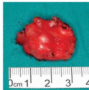
Fig. 4. Extirpated tumour mass.

a pleomorphic adenoma in ESGT (Figure 4). Postoperative course was uneventful, and function of the facial nerve remains intact. No recurrence was detected during the four-year follow-up period.