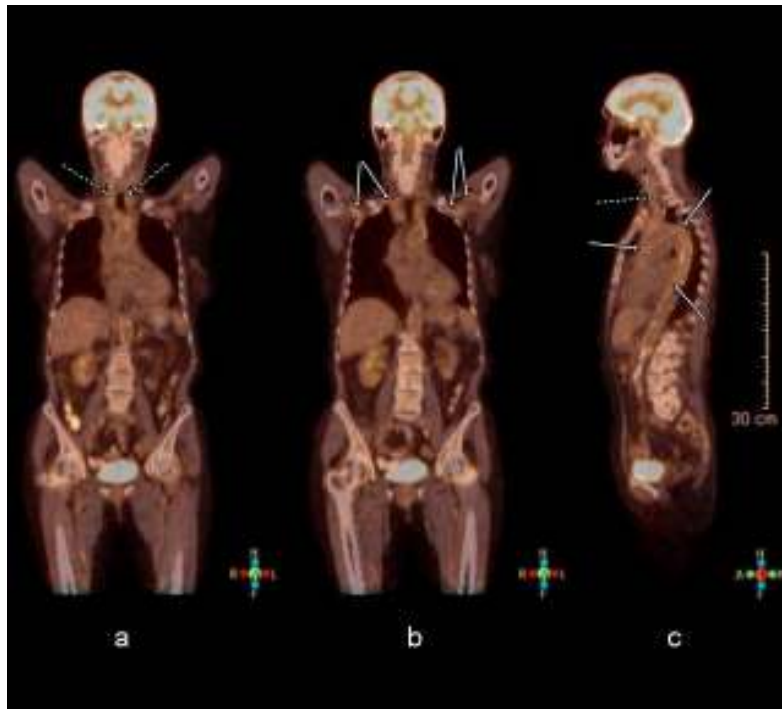
Fig. 1 Whole body integrated PET/CT. Coronal views (panels a and b): increased FDG uptake in the walls of subclavian and proximal brachial arteries (full arrows), as well as carotid arteries (dotted arrows) bilaterally. Sagittal view (panel c): increased FDG uptake in the walls of the ascending, descending and abdominal aorta (full arrows), as well as carotid arteries (dotted arrows)