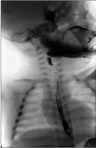
Figure 1: Tube esophagogram with gastrografin showing the contrast between esophagus and trachea indicating „H“-type esophageal fistula.

Identification of the fistula intraoperatively was facilitated by traction on the wire by the anesthesiologist. Once the fistula was well exposed and isolated, it was doubly ligated and divided. The baby had an uneventful early postoperative outcome and is doing well on follow up over a year now.