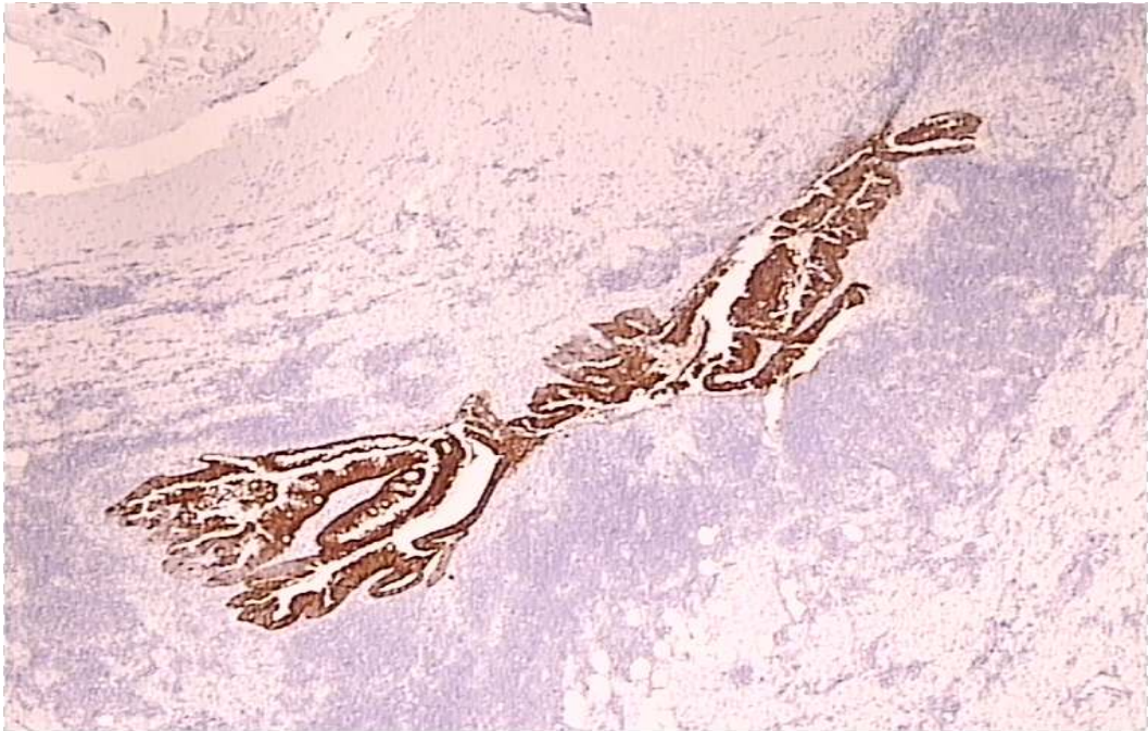
Figure 4. Pathohistological diagnosis of removed appendix revealed adenocarcinoma of the appendix immunohistochemically positive for CK20+.