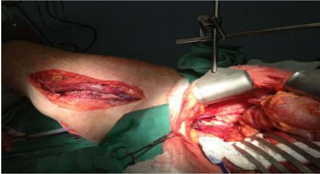
Figure 3. Surgical drains were placed to the retroperitoneum, to the right thigh and to the abdomen. The right thigh incision was not sutured.