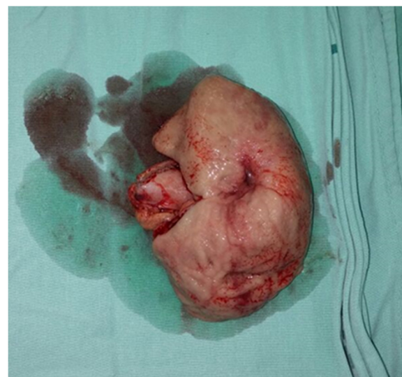
Fig. 3 Pre-pyloric stricture explored during delayed reconstructive surgery after caustic ingestion injury

There was general agreement by all respondents that signs of peritonitis and presence of pneumoperitoneum and/or perforation of the esophagus are indications for immediate surgical intervention. Similarly, most respondents suggested that any clinical or radiological evidence of perforation also dictated urgent operation. Another late indication for urgent surgical intervention that should be recognized is bleeding due to necrosis developing several days after the initial admission [70–72]. Other abnormalities which may accompany later clinical deterioration and suggest the need for surgical intervention include: persistent acidosis, renal failure, or extensive burns requiring endoscopic evaluation [72, 73]. While most respondents performed laparotomy, initial laparoscopy was also mentioned as a viable alternative in the more stable patient, but is clearly operator dependent based upon the skill set and experience of the surgeon, as thorough exploration of