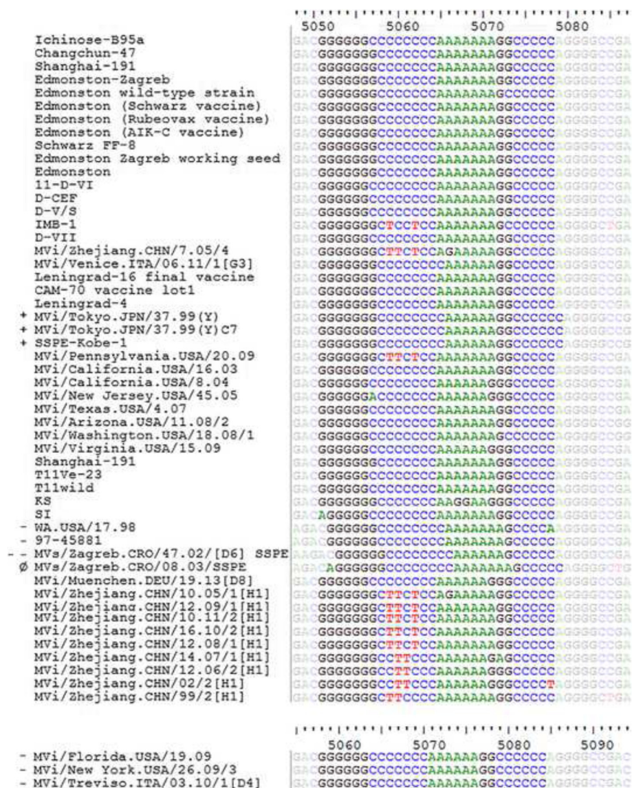
Fig. 1 Multiple sequence alignment of measles genomic cDNA, showing a segment of F gene 5' untranslated region. Legend: Nucleotides at positions 5051–5078 (or at corresponding positions in non-canonical strains) are highlighted. Strains in which insertions or deletions were detected in 5051–5078 region are indicated with plus or minus, respectively. A strain in which the insertion is located before and the deletion after 5051–5078 segment is indicated with ∅

The consensus sequence of the 5051–5078 segment in canonical strains is G 6-7 C 7-8 A 6-7 G 1-3 C 5-6 , the total number always being 28. The sequence of this region in 54 different MV strains is presented in Fig. 1. Non-canonical