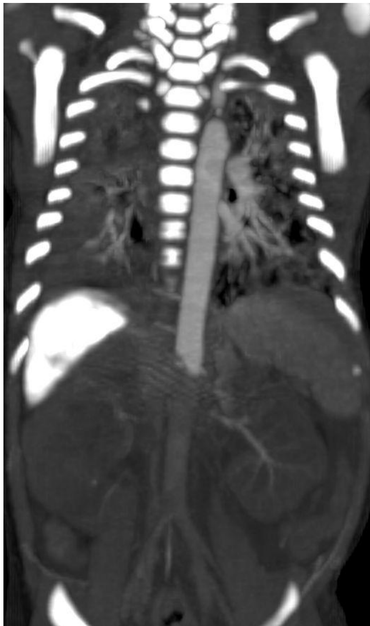
Figure 1. CT aortography showing thrombotic occlusion of the abdominal aorta from the level of celiac artery extending to both common iliac arteries. Both renal arteries ostia are occluded. Right kidney is edematous due to ischemia, and some collateral perfusion of the left kidney can be seen.