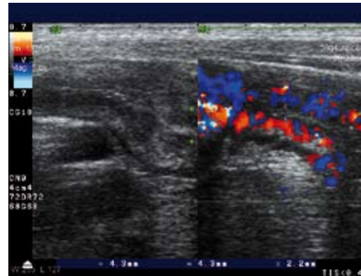
Figure 3. B-mod ultrasound and color Doppler of the terminal ileum of a patient with active Crohn disease. Wall thickening higher than 4 mm and strong hyperemia (grade 3).