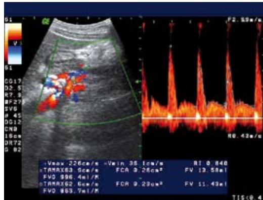
Figure 1. Color and pulsed Doppler measurements of flow volume in the superior mesenteric artery of a patient with active Crohn disease. Flow volume is higher than 850 mL/min.