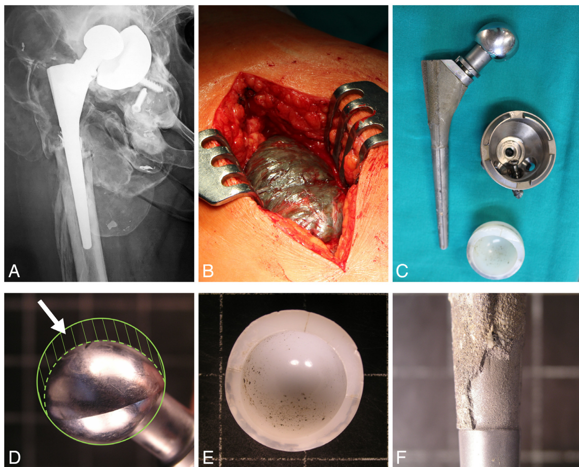
FIGURE 1. (A) Preoperative anteroposterior right hip x-ray showing acetabular cup dislocation, eccentric femoral head wear, “cloudy bubbles,” and pseudotumor formation; (B) intraoperative image after a direct lateral approach to the right hip showing extensive metallosis; (C) intraoperative image of the extracted endoprosthesis components; (D) eccentric wear of the femoral head (posterior view, arrowhead pointing approximately at the worn part of the femoral head); (E) metal debris particles embedded in the acetabular polyethylene – most of the particles are embedded in the part of the liner that was not in contact with the worn femoral head; (F) damaged titanium porous coating on the extracted femoral stem.

A 56-year-old woman was referred to our outpatient clinic in 2018 because of pain and right hip decreased range of motion. She underwent a right-sided THA in 2001, when a modular neck implant and femoral stem with proximal titanium porous coating were used (acetabular cup: SPH-CONTACT; femoral stem: F2L Multineck; Lima Corporate, Villanova San Daniele del Friuli, Italy). Early postoperative period was uneventful. In 2012, the patient sustained right-sided trans-acetabular and inferior pubic ramus fractures, which were successfully treated conservatively. Since 2016 she complained about increasing pain in the right groin re-