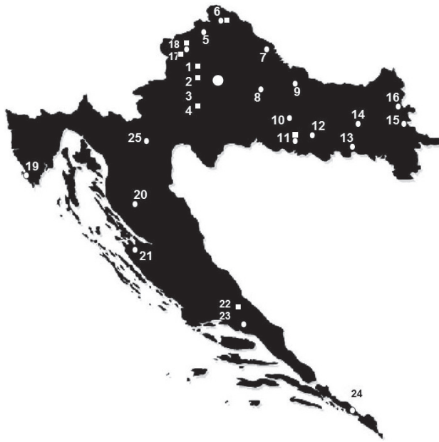
Fig. 1. Map of Croatia showing 12 hospitals and 13 Institutes of Public Health

CHC Zagreb-1, GH Sv.Duh Zagreb-2, CH Dubrava Zagreb-3, IPH Zagreb-4, IPH Varaždin-5, IPH Čakovec-6, GH Koprivnica-7, IPH Bjelovar-8, IPH Virovitica-9, GH Pakrac-10, GH N. Gradiška-11, GH Požega-12, IPH Sl.Brod-13, GH Našice-14, GH Vukovar-15, IPH Osijek-16, IPH Zabok-17, GH Zabok-18, IPH Pula-19, IPH Gospić-20, IPH Zadar-21, GH Split-22, IPH Split-23, IPH-Dubrovnik-24 and GH Ogulin-25.