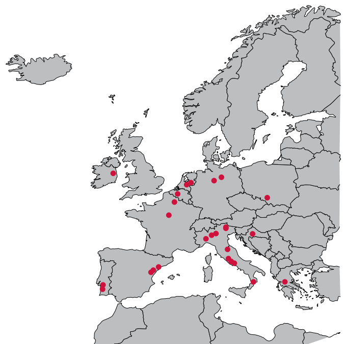
FIGURE 1 European network for ICU-related respiratory infections (ENIRRI) participating centres. Number of centres: Italy n=6; Spain n=5; France n=2; Portugal n=2; Germany n=2; the Netherlands n=2; Belgium n=1; Greece n=1; Ireland n=1; Czech Republic n=1; Poland n=1; Serbia n=1; Croatia n=1; Argentina n=1 (not shown on map); Brazil n=1 (not shown on map).

All consecutive adult patients admitted to the ICU of participating sites and presenting with nosocomial pneumonia are eligible for the study. Enrolment is performed during a 12-month period, with a maximum of 50 cases per centre. ICUs which take part in the ENIRRI project agree to prospectively collect the data, clearly document in the medical chart all the information required for the data analysis and transfer the data to the principal investigators of the project. Specific inclusion criteria are: age \geq 18 years; diagnosis of a nosocomial respiratory infection, as defined earlier; admission to either the ICU or a high-dependency unit (the patient may be admitted to the ICU with nosocomial pneumonia or may develop pneumonia during their ICU stay); and informed consent (if required according to local legislation). Case report forms are