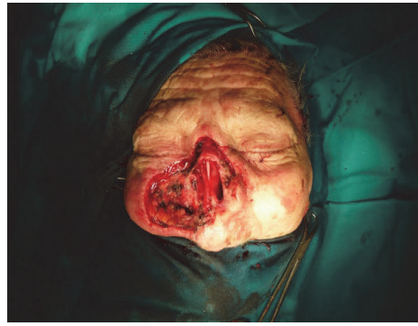
(b) Intraoperative surgical defect involving the nose, the central portion of the upper lip, and part of right cheek