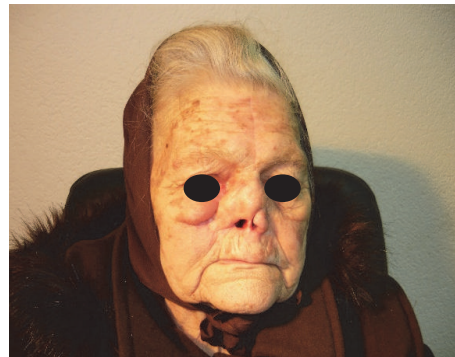
(d) Good aesthetic result nine months after surgery