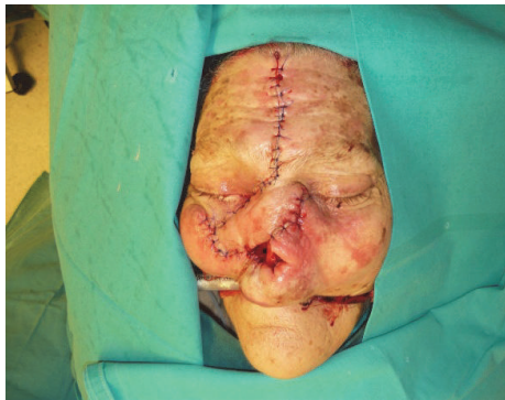
(c) Completed reconstruction of the facial defect