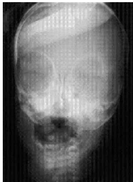
Fig. 2. Atypical A-P x-ray of the skull: Diffuse massive cortical thickening of mandible with hyperostosis and bone enlargement. Other parts of the skull show normal radiological bone structure.

Antibiotic therapy was withdrawn, the sedimentation rate, CRP and lymphocyte decline were on the half of their initial values. The local finding almost disappeared, and the child was discharged. Three months later, local